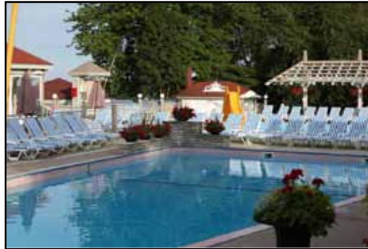
One of two out-door pools at the Fern Resort